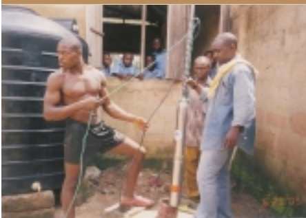
Above: Drillers work to install the submersible pump on completion of water well ~ 165 feet deep.