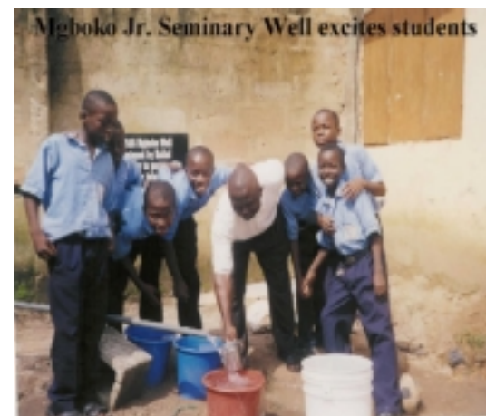
Above: A teacher & the students of the Seminary celebrate the new fresh well water gushing out from deep below the school ground.

Do you know that thousands of children will not attend school tomorrow because of malaria & water borne diseases in the tropics? You can be a part of the solution today. Contact us by mail, email, or phone at the side bar on this page.